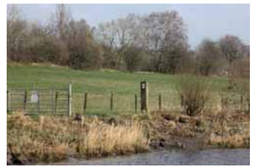
Lochshore field site

restructured and redesigned to provide a more attractive and usable public space. In addition, the part of the field not being used by the clubs can host recreational and sporting activities organised by the Regional Park Authority