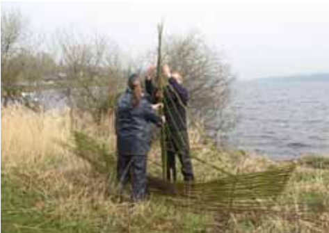
Participants making a willow boat

The Park has long been involved in promoting mental health but nowhere is this more evident than in our delivery commitment to the Forestry Commission's model of woodland activity, 'Branching Out'. Park staff have just completed our fifth successful programme at Castle Semple Centre and would like to thank the participants for their contributions. We hope they will continue to use the Park and the outdoors to continue the benefits to their mental health and wellbeing identified in the programme. Look out for the fantastic willow sculpture that the group made at the entrance to C Semple Centre!