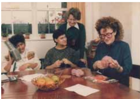
At the Birmingham hostel